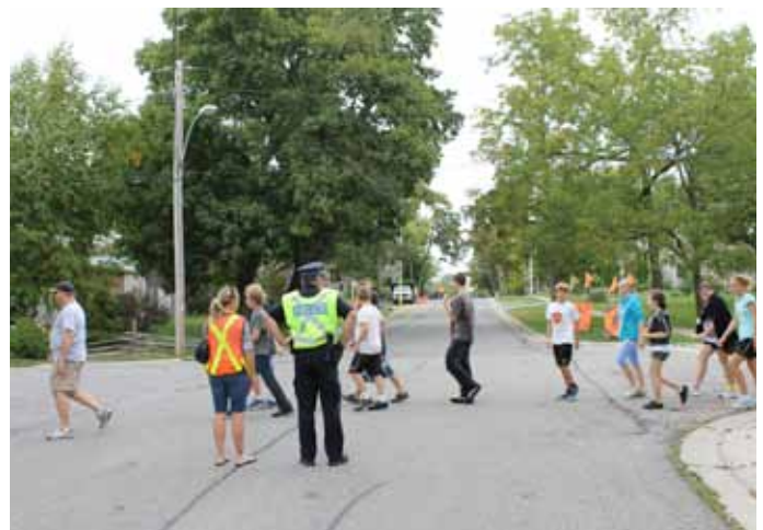
Police provide support