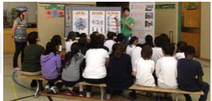
Students learn about cycling safety