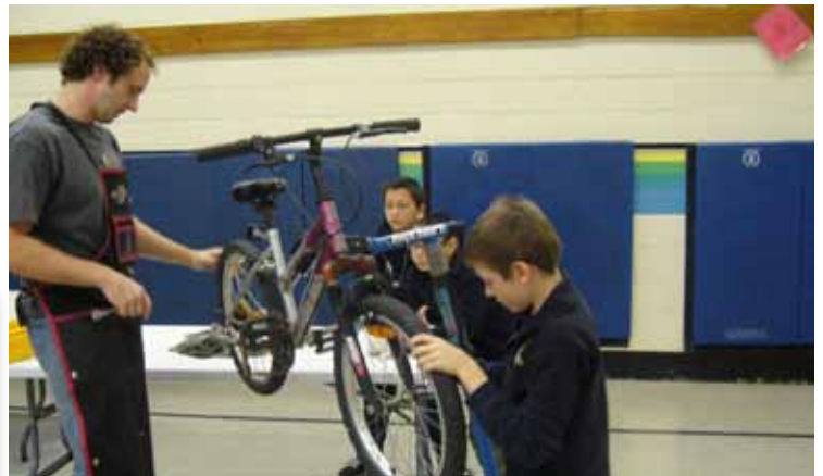
A bike repair workshop