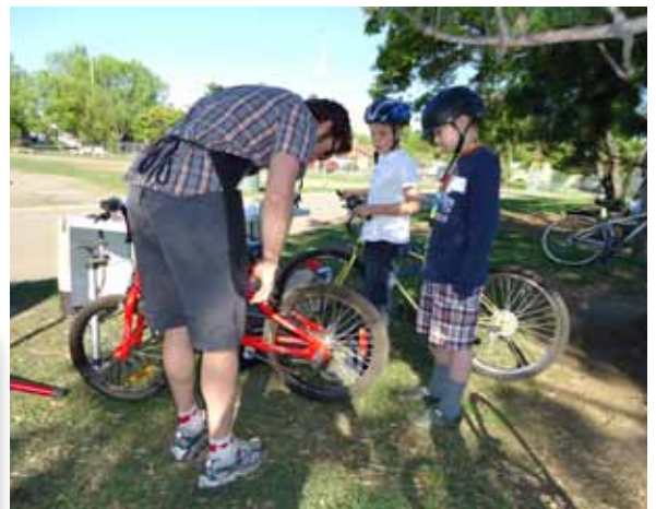
Students check out the bike repair workshop