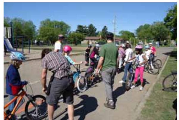
Bike safety training on the school grounds