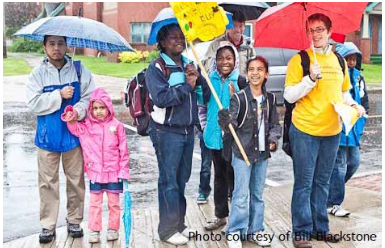
Walking School Bus enjoying a stroll in the rain

"[The Walking School Bus] has been successful in decreasing the use of school buses [courtesy rides] by children who live within walking distance of the school; it has also increased engagement between the community, the school and parents of children who attend Viscount Alexander Public School."