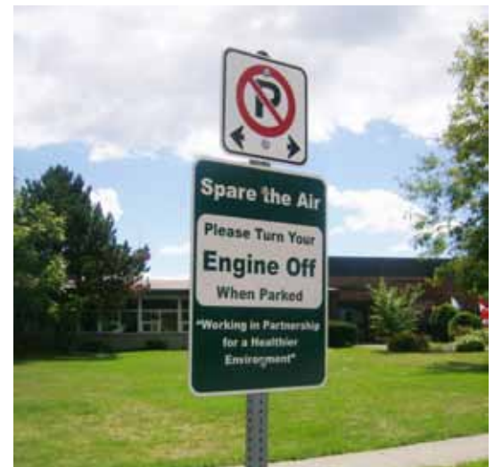
New anti-idling signs posted

Encouragement events such as International Walk to School Day (IWALK) were important contributors to shifting mindsets and transportation behaviour.