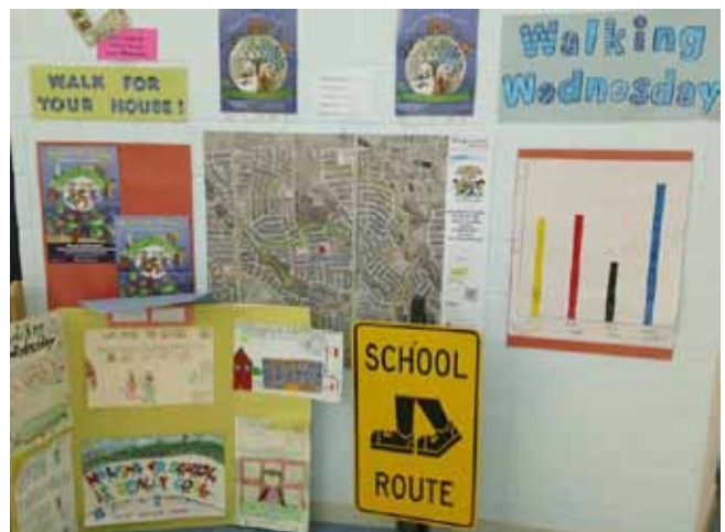
Display showcasing a walking routes map, street sign, and Walking Wednesday participation tracking