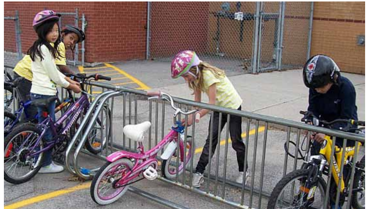
Students try out a new bike rack

Through the Bike Rack Seed Funding Program offered by the City of Hamilton Public Works Department, using funding from the Ministry of Transportation, 16 schools purchased and installed new bike racks. Kids had been locking bikes up on trees etc. so having the new bike racks improved safety.