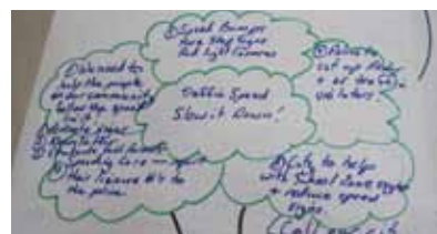
Brainstorming solutions for issues identified

Students from all three schools came together in a seminar to share experiences and brainstorm solutions to the issues raised.