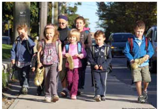
Broadview students celebrate IWALK