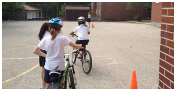
Students practice their cycling skills