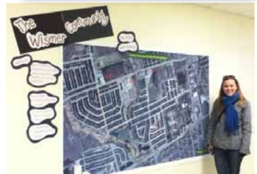
Large map of school catchment area

"It would be amazing to do a car count today! We have NO traffic anymore." From York Region School Travel Plan - Pilot Project Report 2010-2011