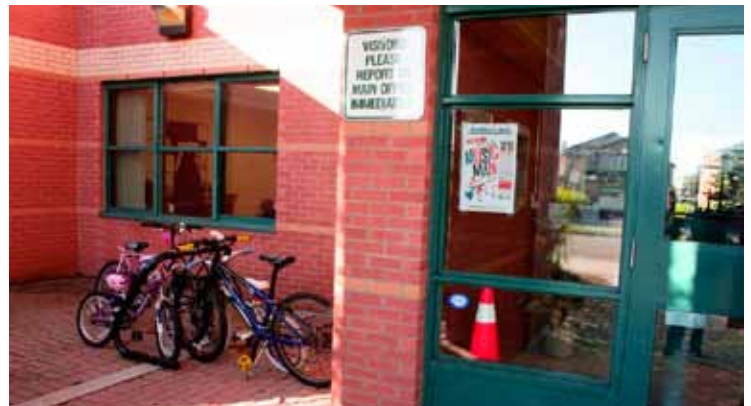
Bikes parked safely by the front office