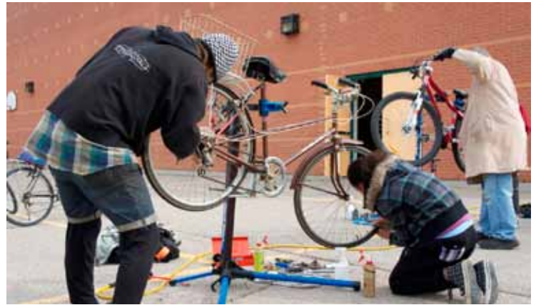
Students have their bikes inspected by a mechanic

After working on raising awareness among school personnel, students and parents, Waterloo Region's stakeholder group realized that winning over individual school champions was not translating into sustainability from one year to the next. Buy-in was needed from the top and on a systemic level, so an Active Transportation Charter for school boards was developed by the stakeholder group to guide future policy development. The Charter was unanimously adopted in May 2011 by both school boards. Beyond the Charter, strategic next steps are being planned and work is underway to create a full-time STP Coordinator position. The Charter is available at: www.wrdsb.ca/planning/files/2012/04/Active-Transportation-Charter_WRDSB-only.pdf .