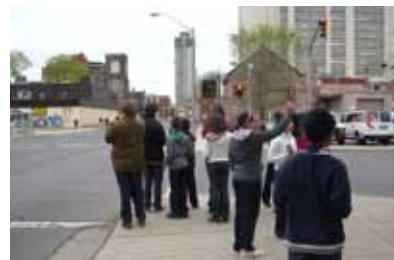
Taking photos of the school journey

Students in Grades 4 to 8, with guidance from adult facilitators, took photos documenting what they saw, heard and smelled on their walk to school.