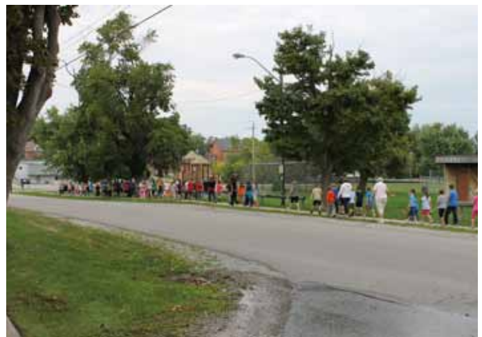
Students take a walk around the school neighbourhood