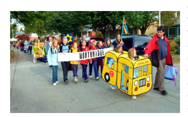
London – This Walking School Bus can help eliminate the need for school buses

While different boards of education have varying safety and age concerns that dictate the walkable distance from the school, it is possible that refinement of the board-approved walking distances can