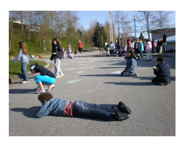
Celebrating Earth Day – children drawing and playing safely on a parking lot closed to traffic

Paving companies typically charge $3 - $4 per square foot for the paving costs alone – the costs of tree removal, leveling, drainage, city sewer hookup and site plan approval would be additional and add up to hundreds of thousands of dollars per job. As an example, Park View Education Centre in Nova Scotia received long-awaited funds in the spring of 2009 to build a new parking lot intended to alleviate traffic congestion at the high school