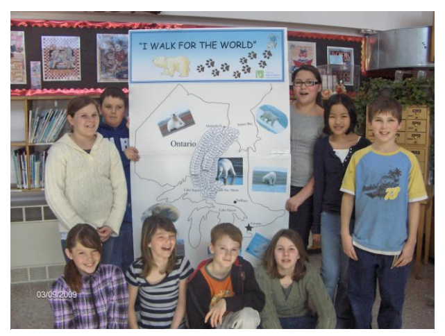
Laird Central School – Children pose with IWALK poster

Ontario curriculum has responded to growing health and environment concerns, as demonstrated by the mandate for 20 minutes of Daily Physical Activity, the Healthy Schools Recognition initiative, a