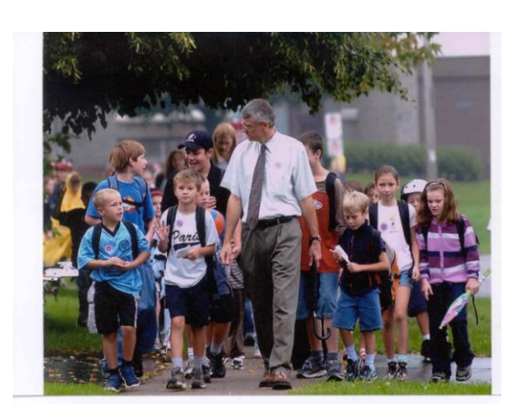
Children walk to school with their principal on IWALK day

As a response to the growing need for a strategy based on these goals, Green Communities Canada (GCC) has worked extensively with the Centre for Sustainable Transportation to create and promote the Child and Youth Friendly Land Use and Transport Planning Guidelines for Ontario (see <a href="www.kidsonthemove.ca">www.kidsonthemove.ca</a>). According to these <a href="Guidelines">Guidelines</a>, the needs of children and youth should receive as much priority as the needs of people of other ages and the requirements of business when it comes to land use and transport planning. The <a href="Guidelines">Guidelines</a> and the School Travel Planning (STP) model work hand in hand to create opportunities for safe, active travel to and from school.