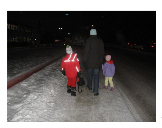
Yukon – reliable clearance of snow from sidewalks ensures safer routes for children choosing active travel in winter

Snow removal from Ontario school parking lots is covered by District School Boards and so the cost is rarely observed or scrutinized by the schools that need it. It would be interesting to know just how much money is spent clearing snow from lots and lanes built to accommodate children driven to school, but this data is not currently available. If schools had less paved space, this cost could clearly be reduced.