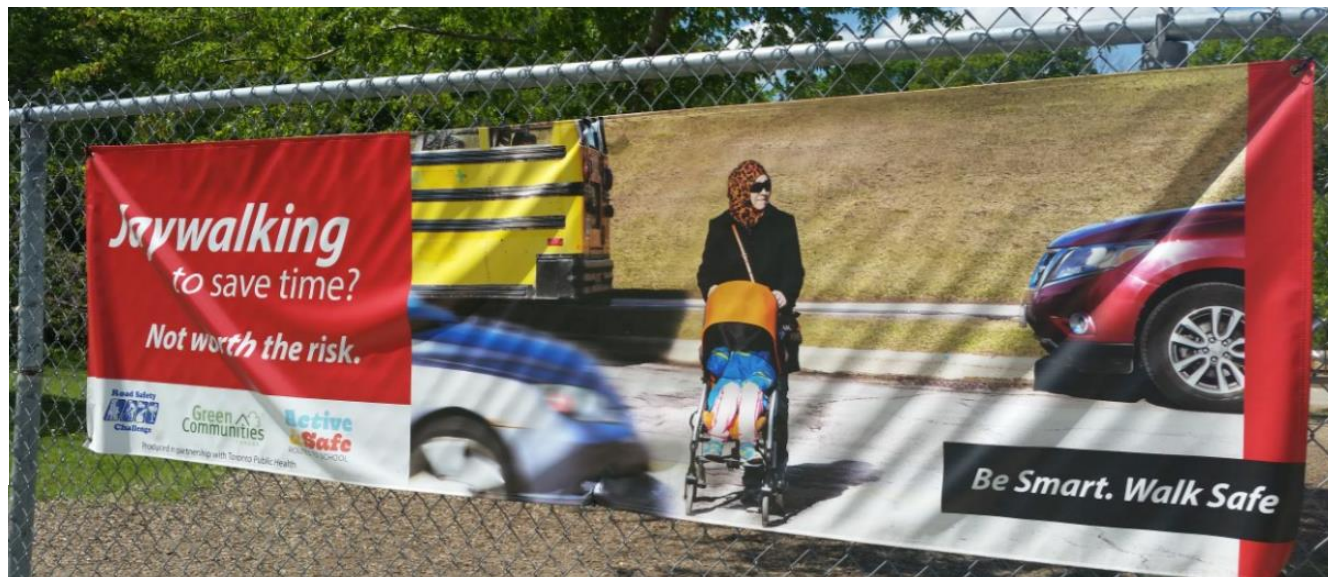
Banner 2: Jaywalking to save time? Not worth the risk. (Shown displayed at Gateway Public School.)

Jaywalking with your friends? Not worth the risk.