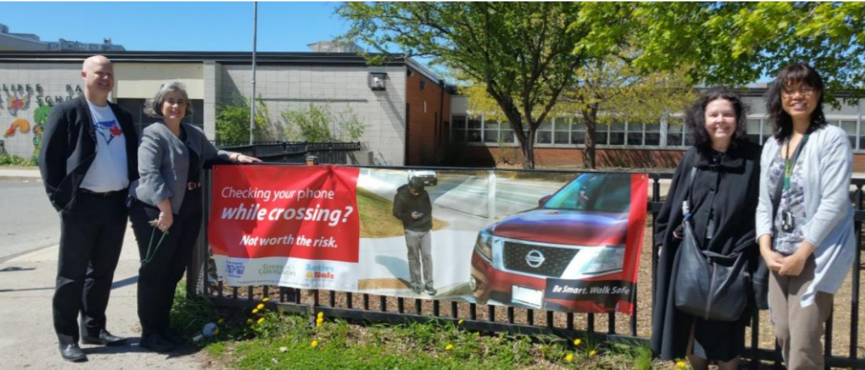
Banner 1: Checking your phone while crossing? Not worth the risk. (Shown displayed at Thorncliffe Park Public School.)