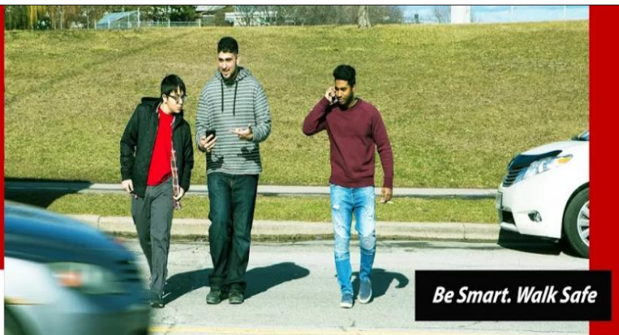
Banner 3: Jaywalking with your friends? Not worth the risk. (Shown displayed at Gateway Public School.)