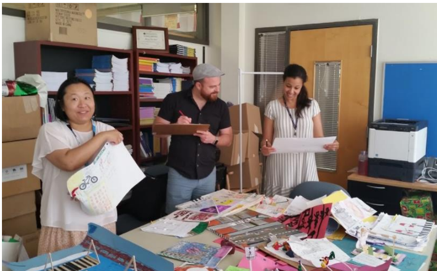
Panel of judges scoring over 300 entries in the Art and Writing Contest.

Toronto Public Health created a toolkit with contest instructions, promotional flyers and posters, and public health nurses delivered this toolkit to all local schools. Two schools participated in this contest; between these two schools, we received over 300 student entries. While the contest instructions left it open for schools how to administer the contest, the majority of entries were from classes where teachers made it into a classroom activity. Entries were judged by a panel of judges from Toronto Public Health, TDSB and Green Communities Canada, and winners were awarded at the End of Campaign Celebration Event in June.