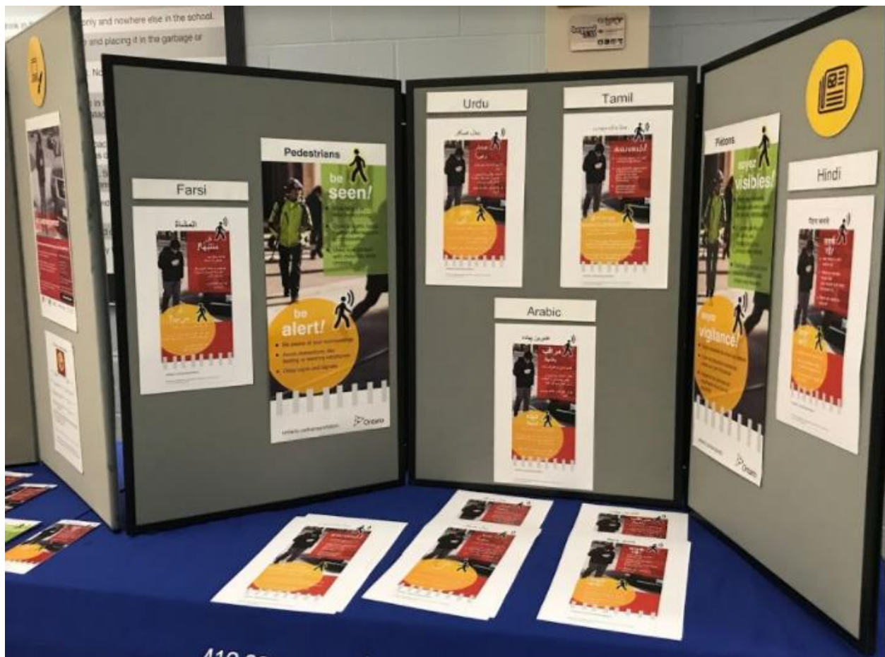
Pedestrian Safety Information posters provided by the Ministry of Transportation, alongside translated posters created by Toronto Public Health, on display at the Campaign Launch Event. (See photo on page 5 for picture of bookmarks and cards.)

In addition, pedestrian safety cards and bookmarks were distributed as part of the pedestrian safety blitzes at schools.